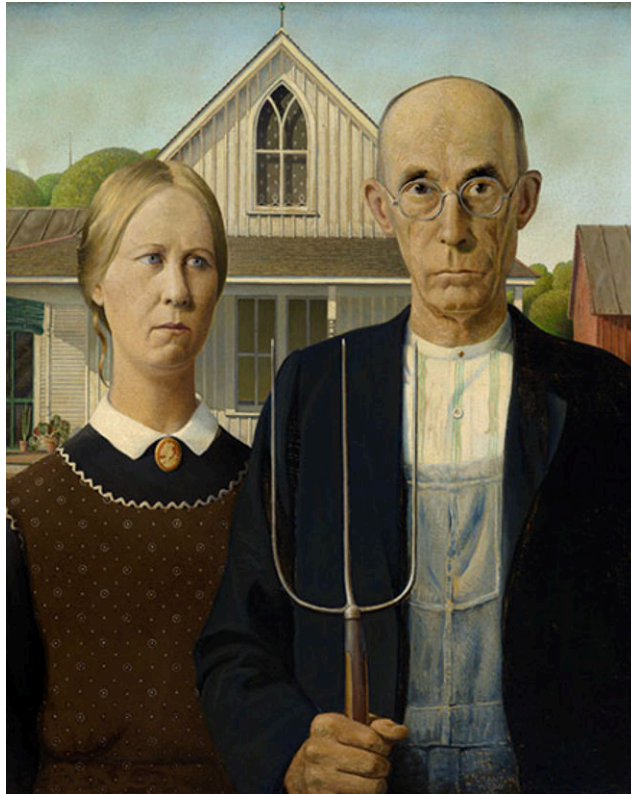
Figure 1: Grant Wood: American Gothic. A middle aged couple tough it out through the Great Depression.