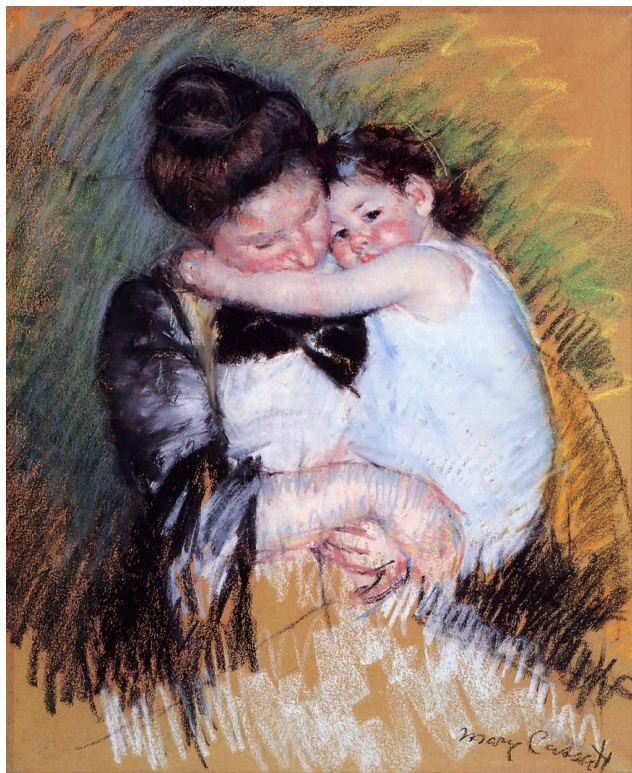
Figure 2: Mary Cassatt: Mother and child.