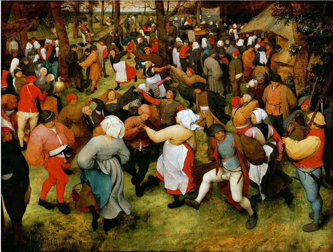
Figure 3: Pieter Bruegel the Elder: Wedding dance. A celebration, a party, a booze-up, a rave. Just looking at it makes you want to tap your feet and join in.